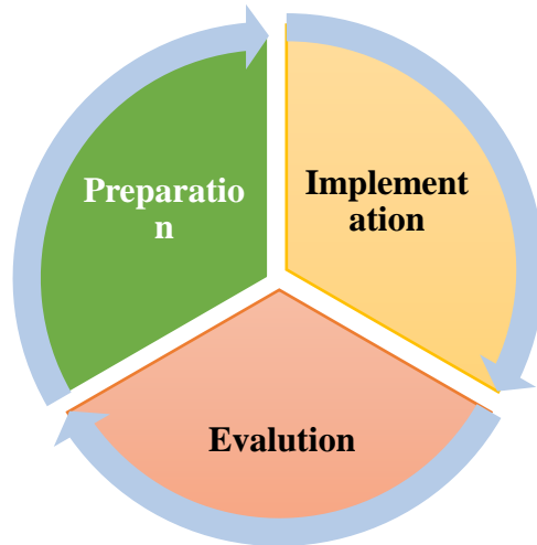
Figure:1- Stages of Developing Pedagogical Competence